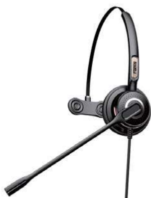
Fanvil - HT201

Fanvil HT201 & HT202 offer a range of premium quality headsets using Fanvil's innovative acoustic technology to deliver speech clarity and an excellent audio experience. Coupled with our sleek design that focuses on comfort and durability, the Fanvil HT201 & HT202 headset offers a new level of experience for call center professionals.