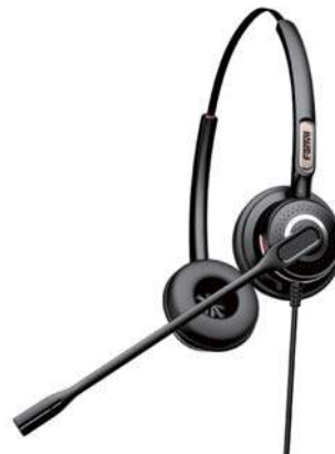
Fanvil - HT202